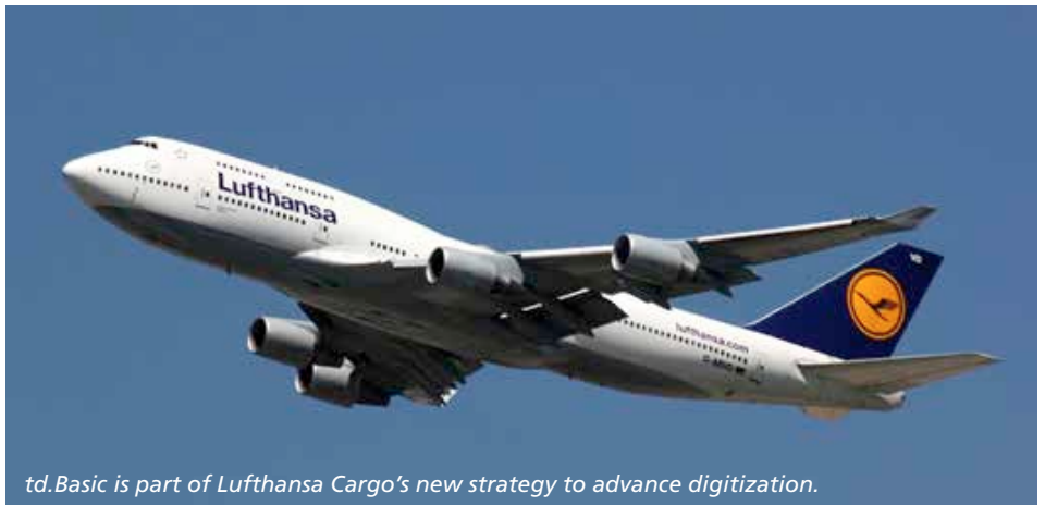
td.Basic is part of Lufthansa Cargo's new strategy to advance digitization.