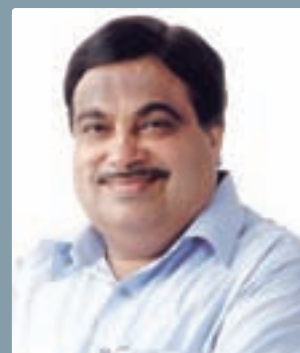
SHRI. NITIN GADKARI UNION MINISTER FOR TRANSPORT AND SHIPPING

SUPPLIES CONTINUE TO HIT, STALEMATE ON 7